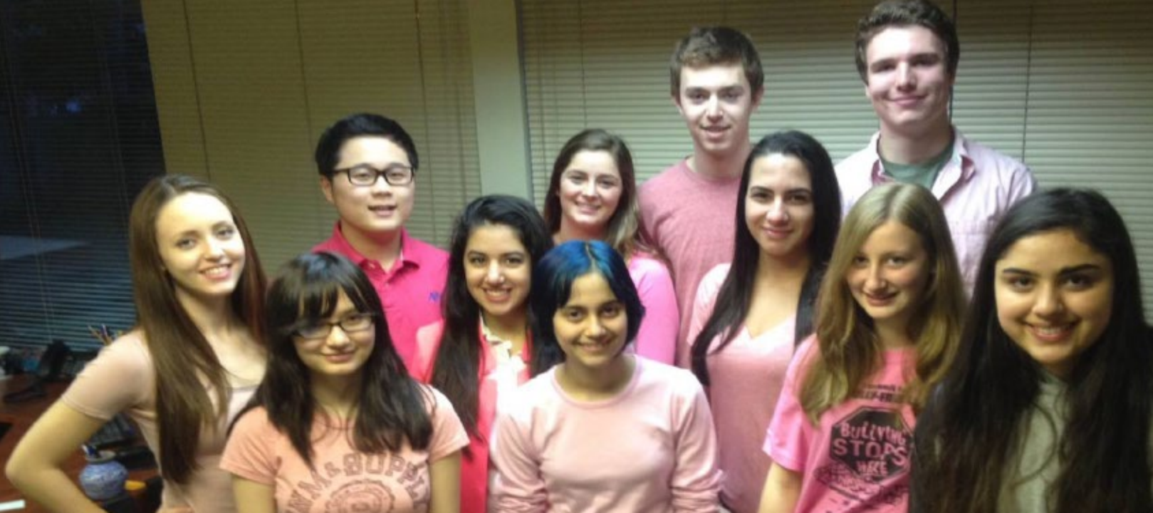
We are so proud of the 12 incredible, smart and dedicated YouthLAB volunteers who worked with us this year to address mental health issues and create effective outreach strategies for youth.