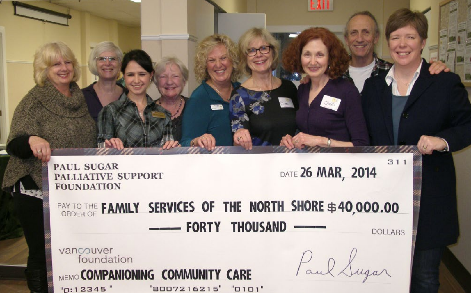
We are very grateful for the generous grant from Paul Sugar Palliative Support Foundation to launch our new Companioning Community Care Program.