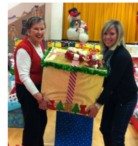
The Christmas Bureau has been a symbol of our North Shore community’s commitment to care for one another for more than thirty years, and this year, it was again an inspiring and emotional experience for all involved.

to all our 350+ volunteers for your generous support of our Agency and its community events.