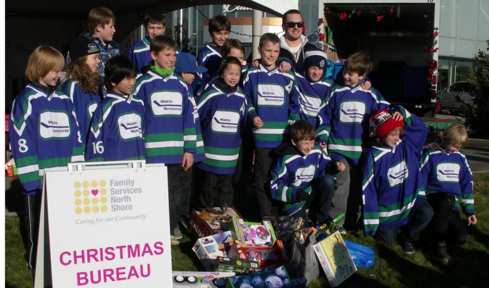
The Northshore Auto Mall hosted our Fourth Annual Toy Drive and brought the community together to fill two half-tonne trucks with toys which were taken back to the Christmas Bureau Toy Shop.

“ My daughter has a safe and judgement free place to go. She is sleeping better, expressing herself and learning how to let me in. ”